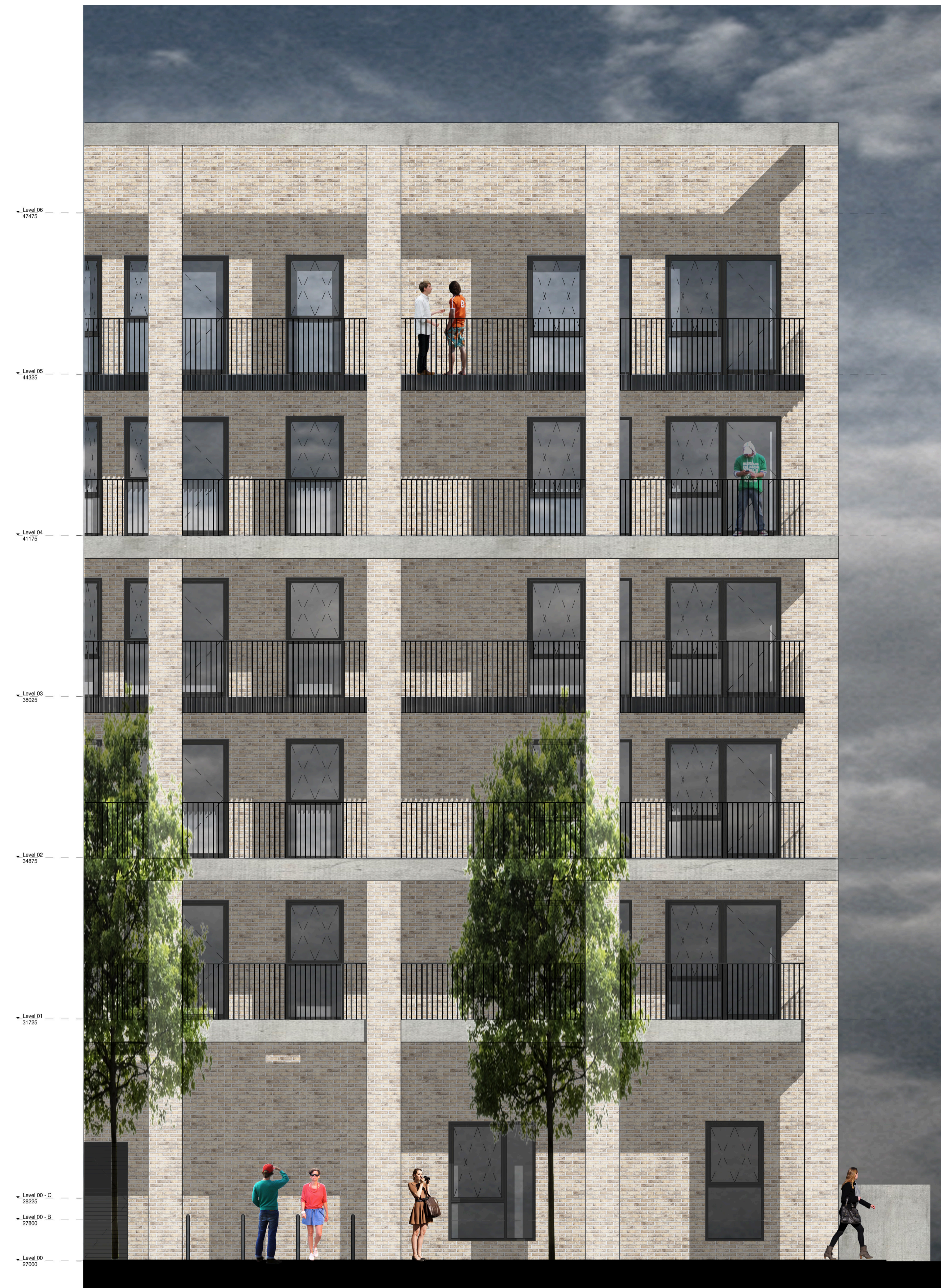
1 Block A Elevation Study 1:50